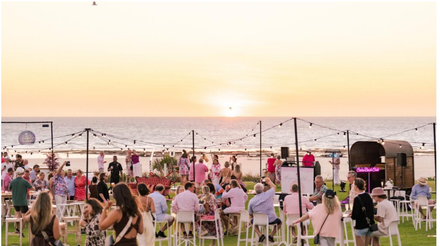
Cable Beach Club 2024 Cup Week