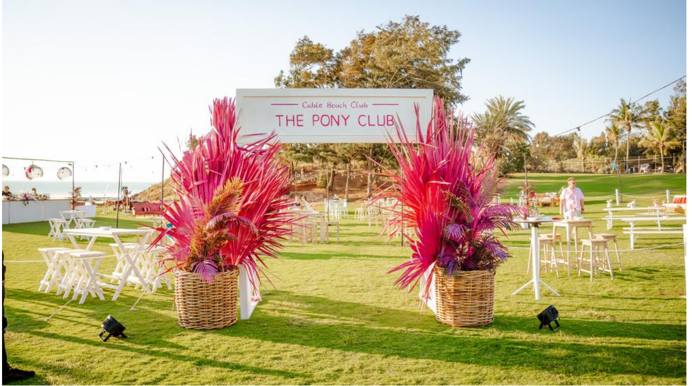
📷 Pony Club Sundowner at Cable Beach Amphitheatre.

2024 Cup Week kicked off on August 22 with The Pony Club Sundowner at the Amphitheatre, where resort guests put on their best outfits with a ‘touch of pink’ and sipped on signature cocktails while absorbing the stunning sunset over Cable Beach.